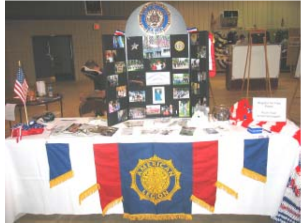
American Legion tabletop display