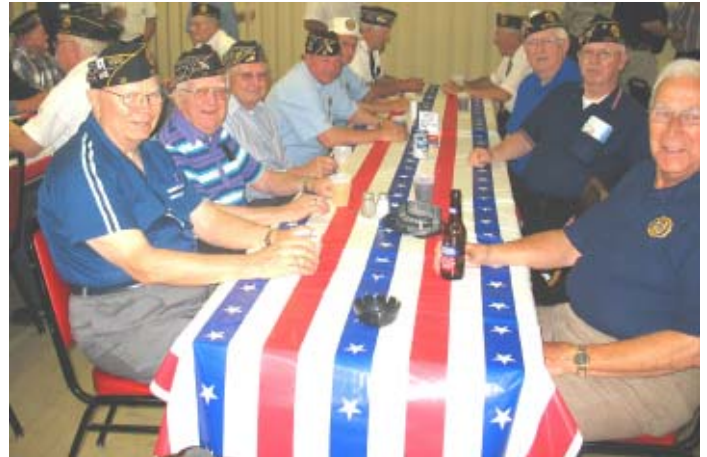
Post 15 Go-Getters at State Convention Go-Getter Meal