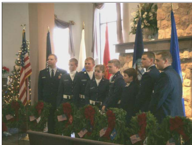
Local CAP members helping out at a recent event.