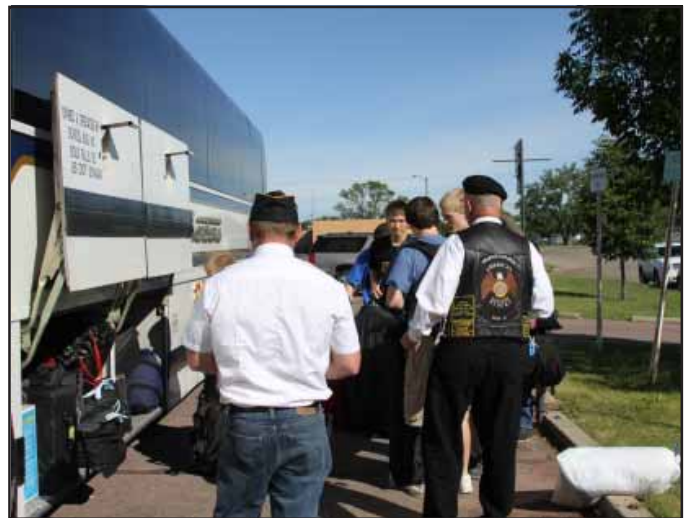
Loading Boys Staters

July 31 Car and bike show at Jono's and the Post.