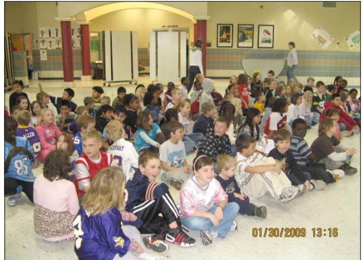
Anne Sullivan school children.