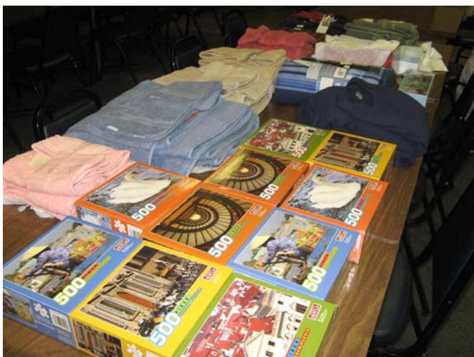
Gifts donated by the Auxiliary for the VA Christmas gift shop.